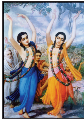
Sri Nitai Pada-kamala ki jai!